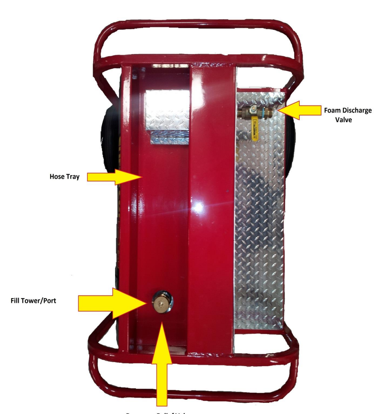
Presssure Relief Valve